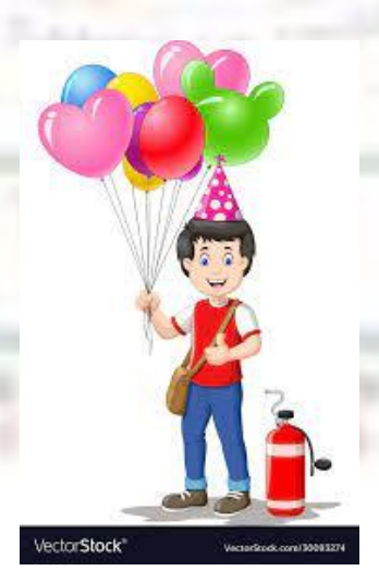
UNIT 5 THE BALLOON MAN